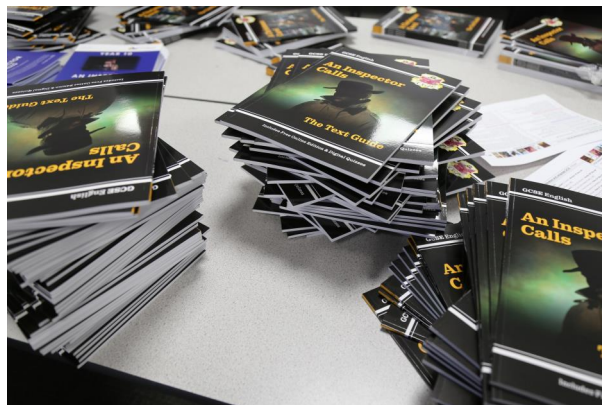
4 - An Inspector Calls revision guides