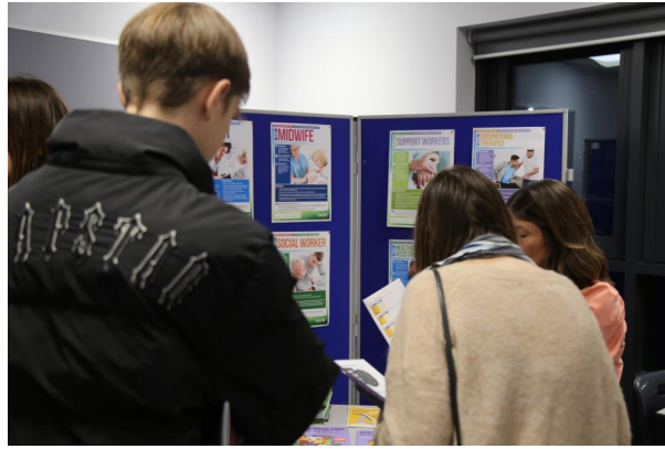
3 - New course Health & Social Care