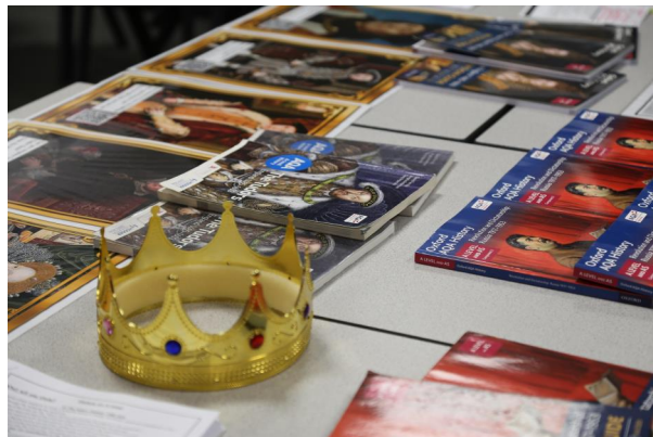
5 - History A Level