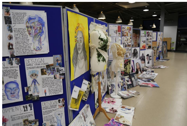
2 - A stunning display of A level art and textiles