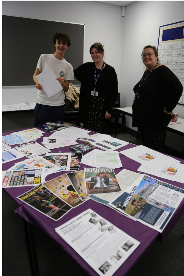
1 - Team Media