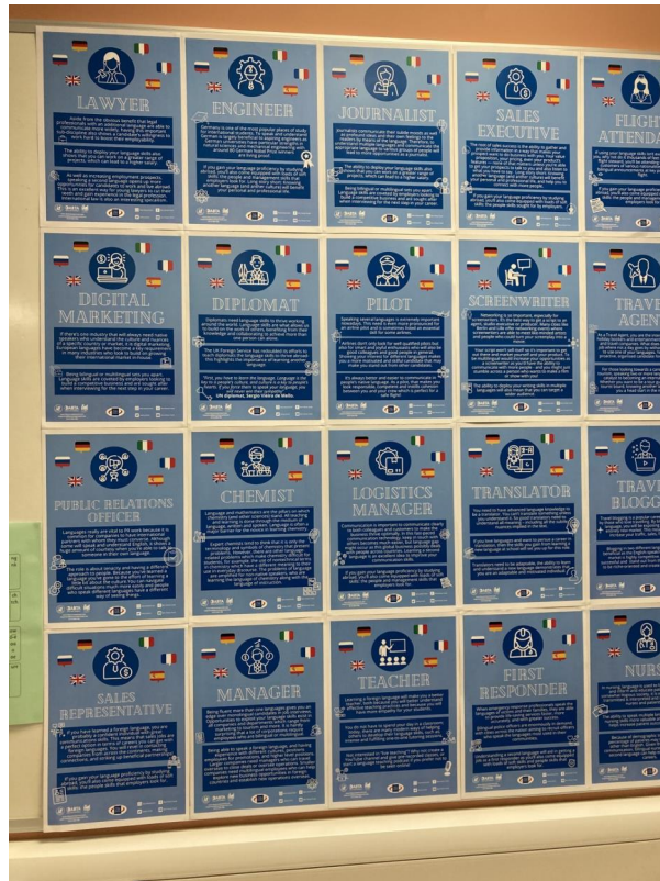
6 - Where will a language take you?