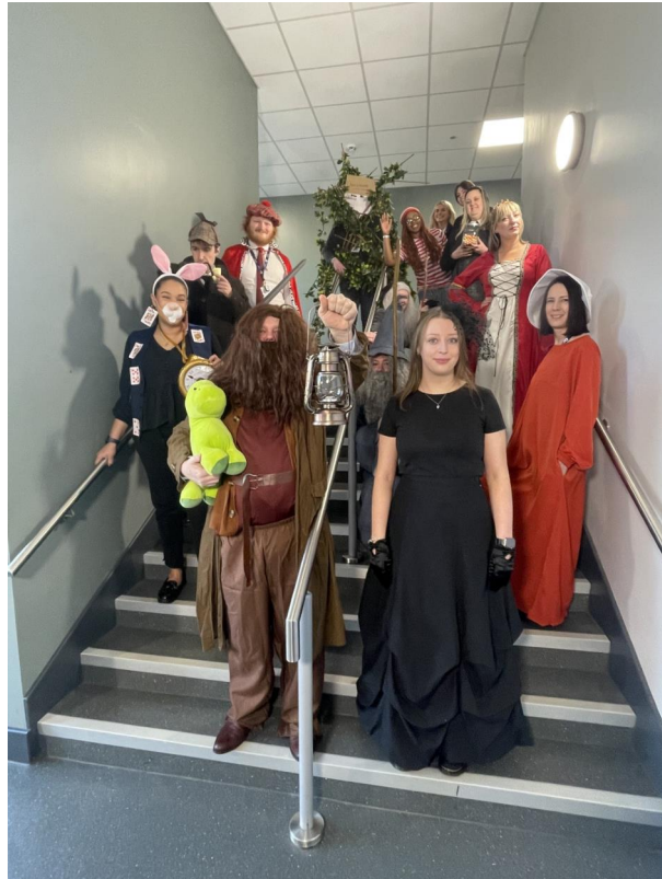
1 - "Till Birnam forest come to Dunsinane!"